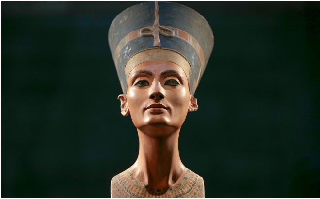
Bust of Nefertiti