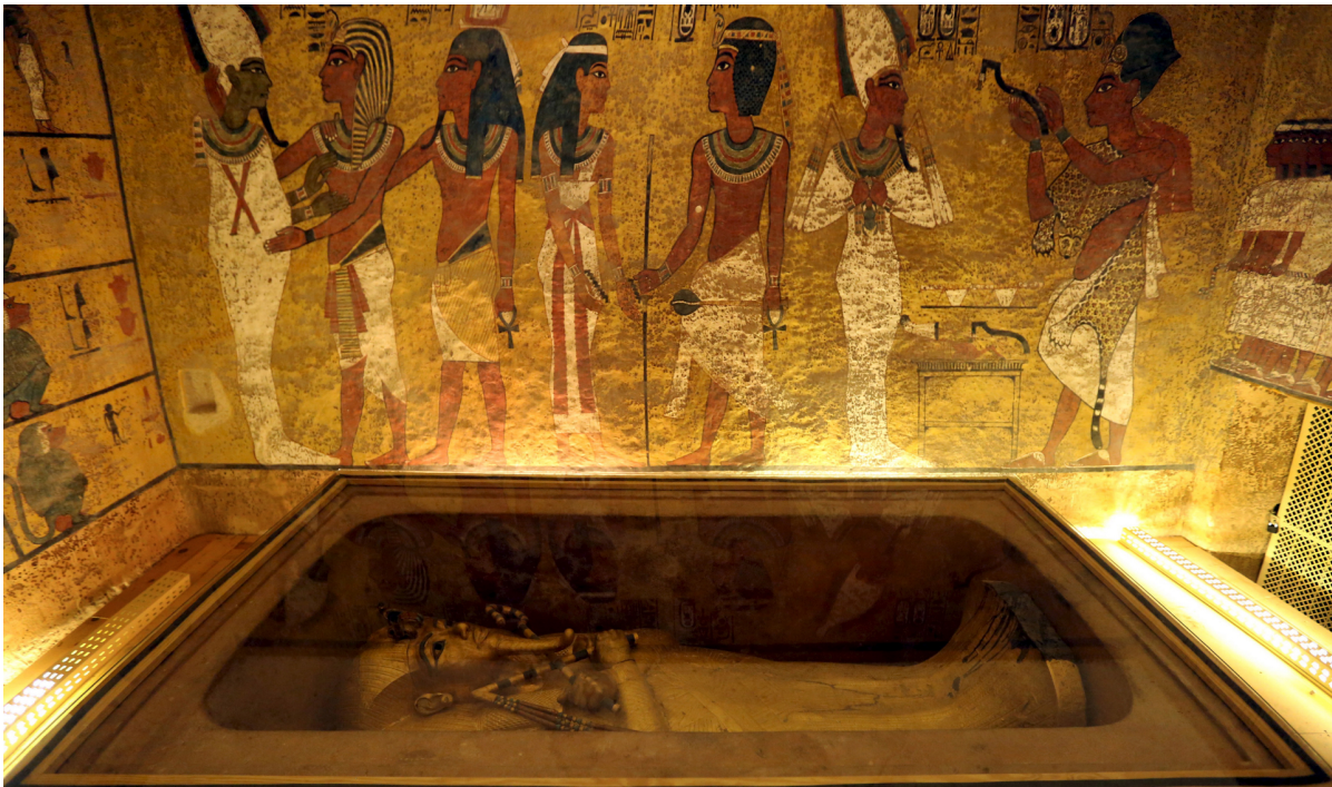
King Tutankhamun's tomb