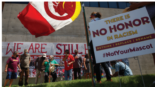
A group stands outside the American Indian Center in 2020 before a press conference on the Washington NFL team's decision to change its team name and logo

Of note this year was the digitization and processing of the American Indian Movement analog tape recordings (collection spans 1972 – 2023). This work included not only hours spent digitizing the analog tape reels, but also time spent listening deeply to the recordings and editing record metadata to ensure that information about the audio is correct and accurate so that it can be made accessible to our MPR brand partners and the public. Of particular interest is an August 28, 1974 interview with Harry Belafonte outside of the Saint Paul courthouse where the trial of Dennis Banks and Russell Means was being held.