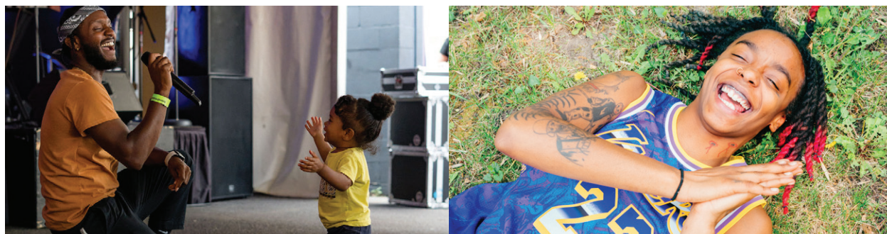
Crowd gathered at and around The Hook and Ladder in Minneapolis for the South of the Southside Festival on Juneteenth