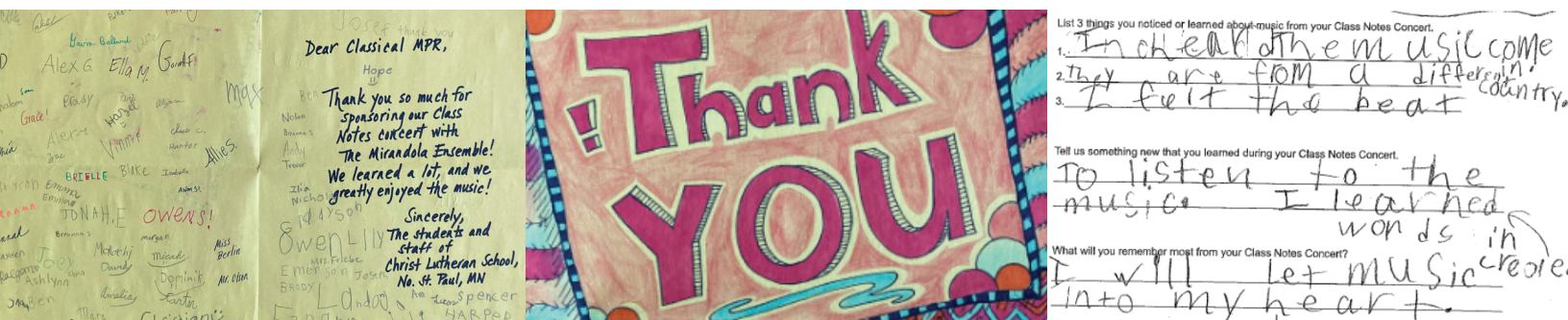
LEFT and MIDDLE: From Christ Lutheran School, North Saint Paul RIGHT: From Student from Linwood Elementary in Saint Paul

Class Notes is continually trying to improve its service to the education community. In addition to post-program evaluations, the Class Notes team is regularly reaching out to teachers across the state for input on our programming. Feedback from teachers has influenced things such as 1) format and delivery of materials (pdfs with live links); 2) integrating a movement-based activity; 3) including grade ranges for lessons and approximate time limits (how long each lesson or activity takes); 4) creating more video that shows professional musicians demonstrating proper technique and tone quality; and 5) developing more lessons that facilitate student creativity, improvisation, and composition in the classroom.