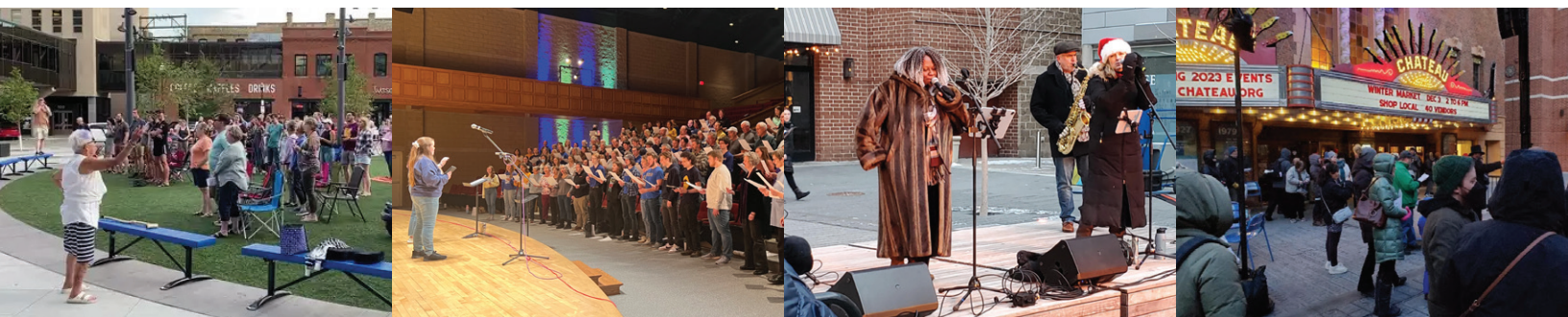
FIRST: Bring the Sing Fargo-Moorhead SECOND: Bring the Sing Duluth at the Mitchell Auditorium on the College of St. Scholastica THIRD: Bring the Sing Rochester FOURTH: Bring the Sing Rochester