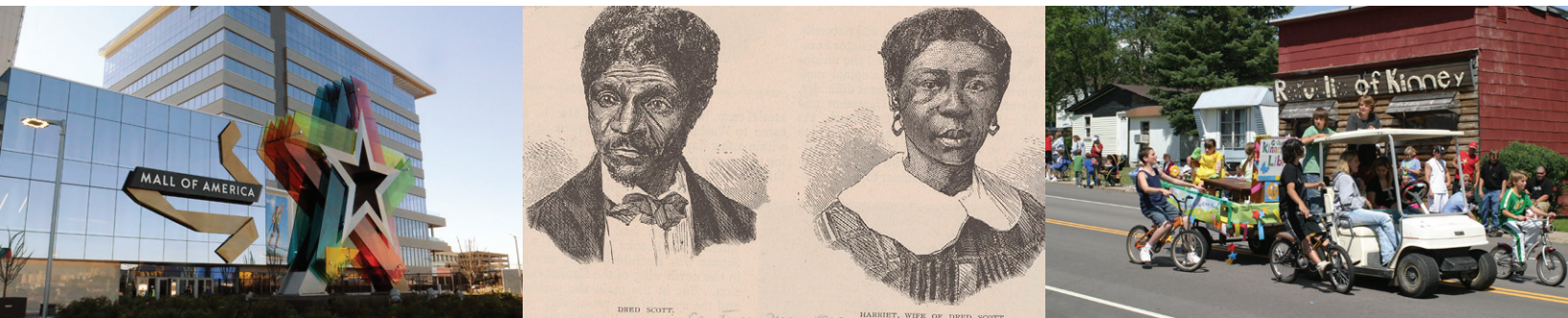
LEFT: The new main entrance of the Mall of America in 2015, flanked by the JW Marriot hotel and an office building MIDDLE: Dred Scott and Harriet Robinson Scott in an illustration from the Library of Congress RIGHT: A parade entry passes a building with a "Republic of Kinney" sign during a Republic of Kinney 30th anniversary parade in 2007

Dred Scott, a black man enslaved to an army officer in the 1800s lived for a time at Fort Snelling. When he later sued his owners to gain his freedom, he used the argument that he had lived in Minnesota, which was considered free soil: Dred Scott's fight for freedom is a Minnesota story