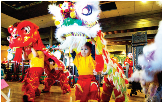
Children perform a traditional dragon dance during the Taste of Little Mekong in Saint Paul