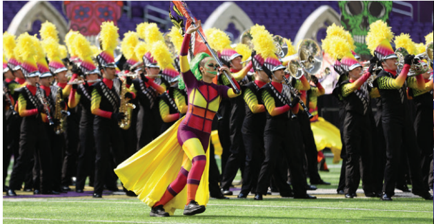
Grand Rapids High School marching band performs at the Youth in Music Championships

Annual high-school marching band championship at U.S. Bank Stadium , featured 21 Minnesota bands nearly half of which were from Greater Minnesota: Relive 34 top marching bands' shows at 2022 Youth in Music Championships this story included an online gallery with more than 100 photos, including of every band.