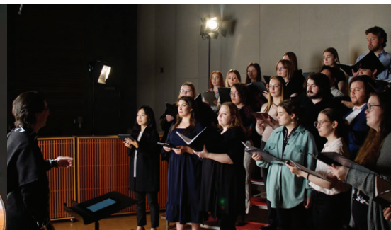
LEFT: St. Paul Chamber Orchestra MIDDLE: The Merz Trio performed at the Minnesota Beethoven Festival in Winona RIGHT: Voices8 Scholars and Augsburg University Choir perform Nunc Dimittis

Highlights of FY23 Regional Recordings include: